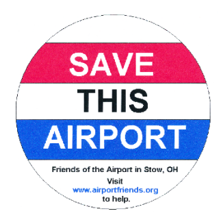
Button art, 2004. KSU Airport, Beckwith Collection