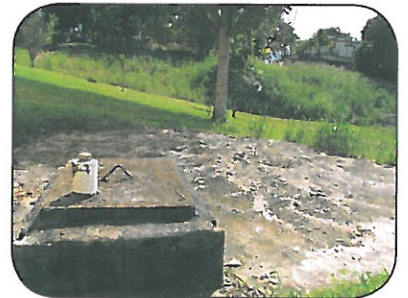
Keep septic tanks sealed.