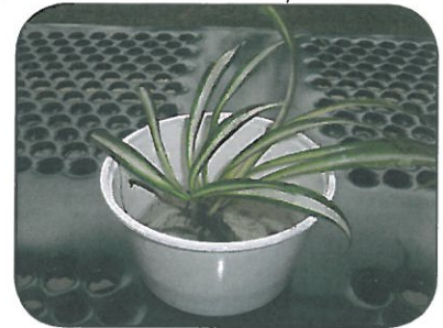
Put plants in soil, not in water.