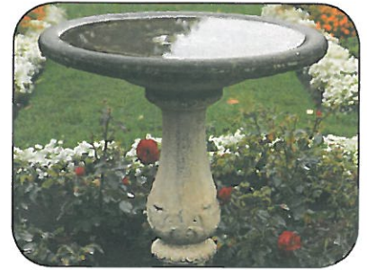
Weekly, empty standing water from fountains and bird baths.