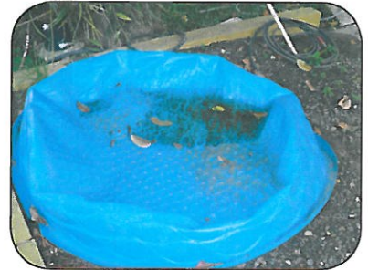
Drain water from pools when not in use.