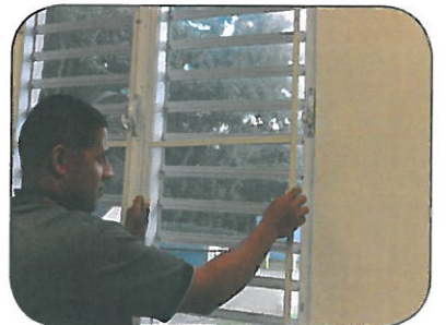
Install or repair window & door screens.

For more information, visit: www.cdc.gov/dengue , www.cdc.gov/chikungunya , www.cdc.gov/zika