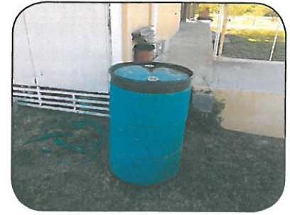
Keep rain barrels covered tightly.