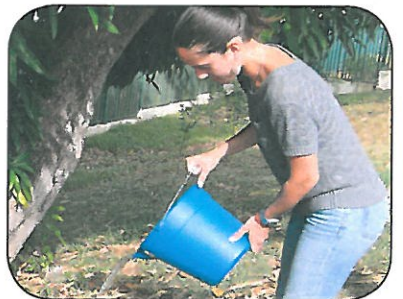
Drain & dump any standing water.