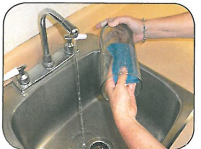
Weekly, scrub vases & containers to remove mosquito eggs.